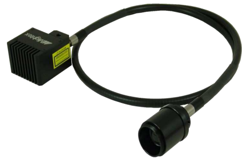
Collimator with light guide and GCS source