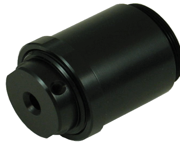
Light guide collimator

The full field of view (FOV) or full divergence angle can be calculated as FOV = 2 \arctan(D/2f) , where D is the light guide core diameter and f is the focal length of the lens. Alternatively, the linear field of view on an object placed at a distance L away from the collimator is D(L/f) .